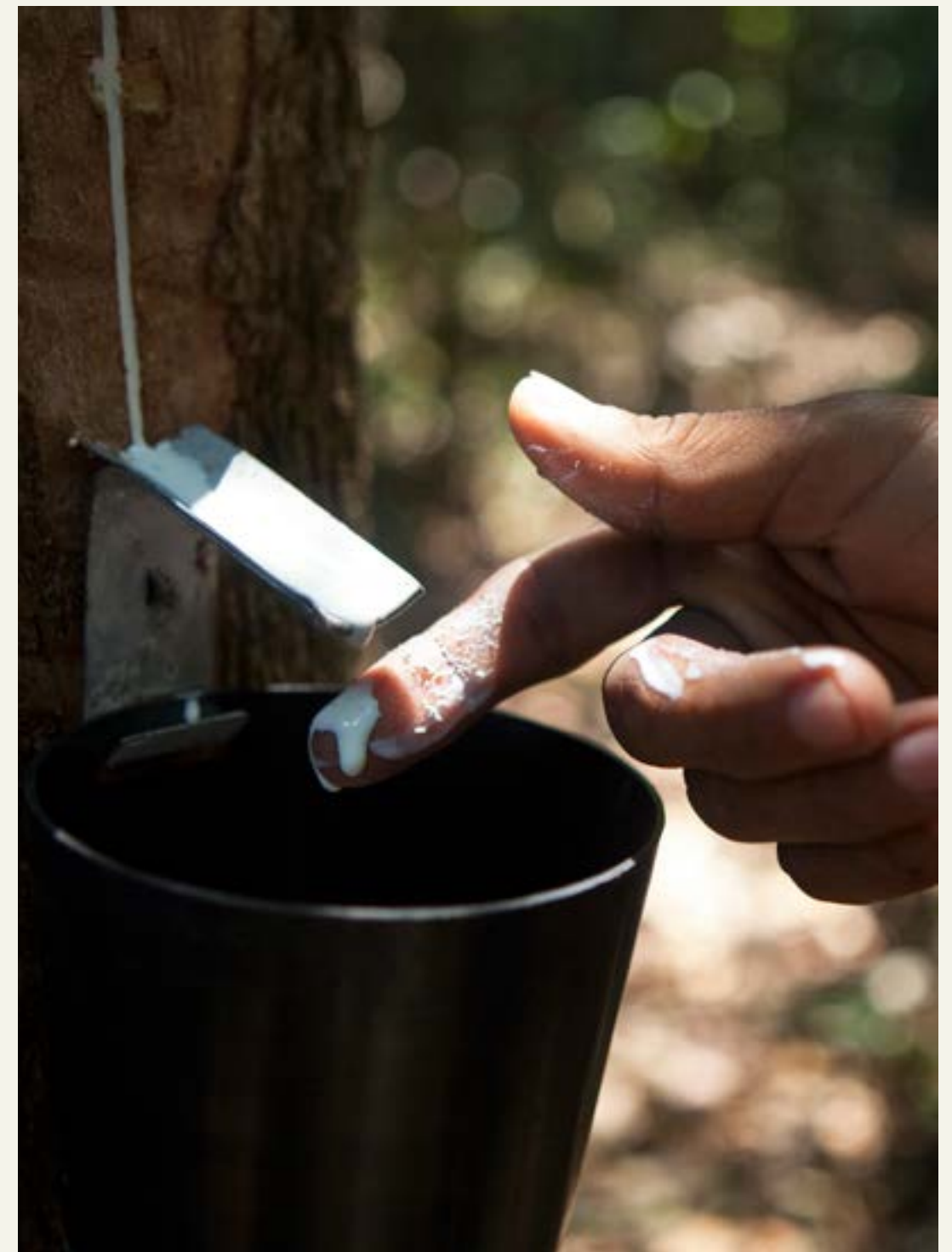
Rubber tappers typically live in the remotest parts of the Amazon, often many hours by foot or by boat from the nearest town or road. Telephone connections can be limited. Local producer organisations often require help to improve their business skills and capacity.